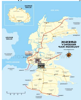
Figure 1. Map of Gresik Regency

Economic growth is the process of increasing the ability of a region to produce goods and services sustainably. This increase is reflected in the increase in the number of commodities produced and the increase in output from the production sector, especially capital goods. In general, economic growth reflects changes and developments in economic activities that result in increased added value of a product (Ivonia Auxiliadora Freitas Marcal et al., 2024). The role of this sector can provide a sustainable impact in creating job opportunities, increasing community income, and managing the use of resources efficiently. Thus, economic growth becomes a key factor in encouraging increased welfare, prosperity, and standard of living of the community (Kamal, 2021).