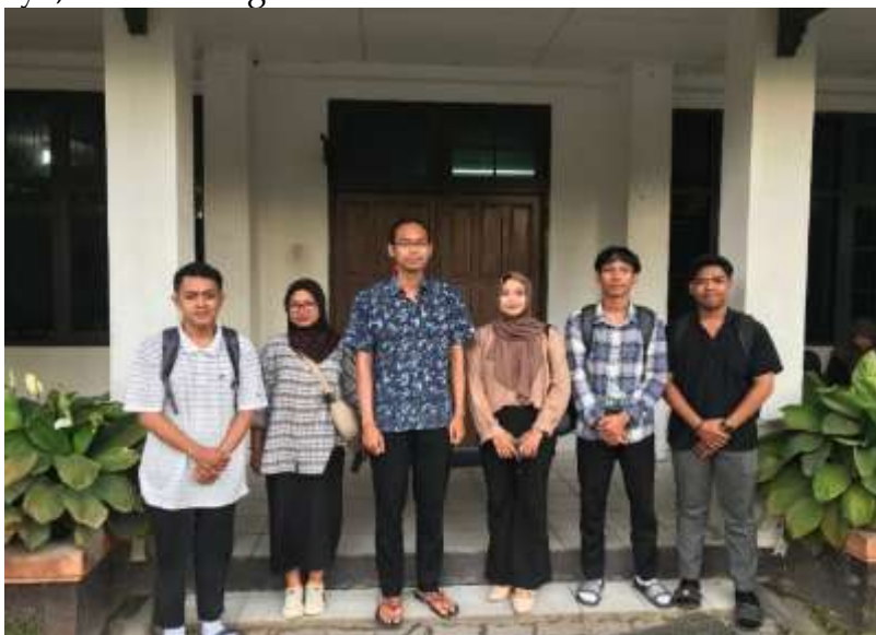
Figure 1. Completion of briefing by the Head of the Constitutional Law Program