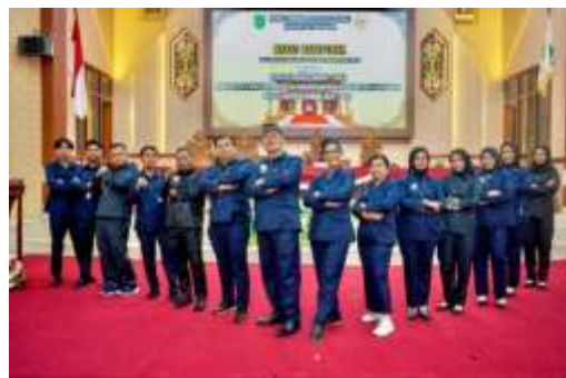
Figure 9. After the inauguration of the elected DPRD members for 2024-2029

In addition, the author also frequently participates in various external activities, such as attending the Sukamara Expo, the Marching Competition, and the Development Parade.