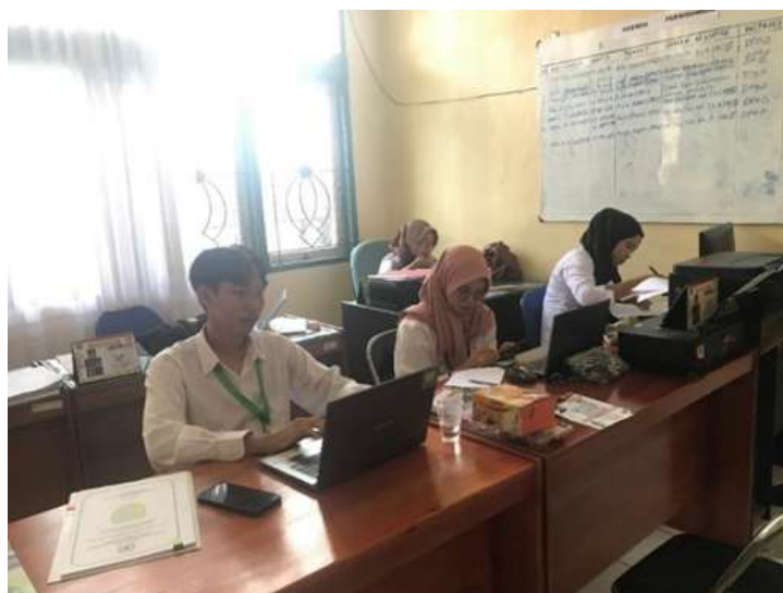
Figure 5. The process of preparing the Plenary Meeting Minutes

After the orientation, the implementation stage began, where the author was given tasks and instructions to assist in the court and legislation department. The author was assigned many activities and tasks, ranging from preparing supporting facilities for Council Member meetings, participating in Plenary Meetings, preparing minutes, making meeting invitations, and preparing the agenda for the inauguration of Council Members for 2024-2029, to finally picking up and saying goodbye to members of the Sukamara Regency Council Secretariat office.