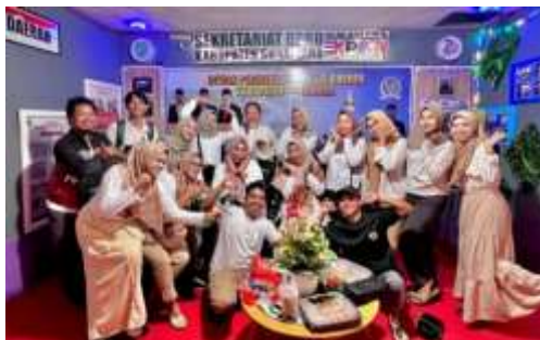
Figure 10. Group photo at the 2024 Sukamara Expo event