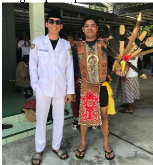
Figure 12. Photo during the development parade activity