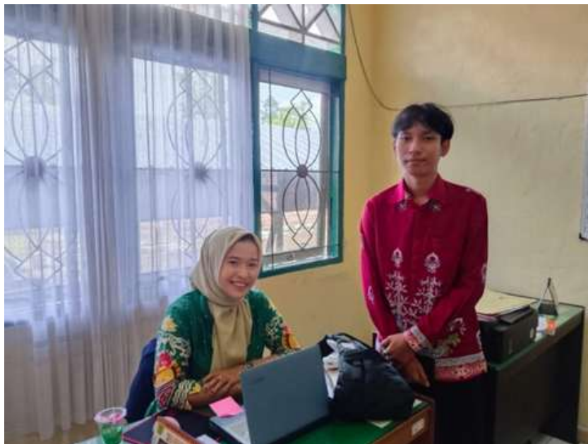
Figure 3. Introduction to the staff of the Proceedings and Legislation Section

At this stage, the author was introduced to the organizational structure of the DPRD and the functions and duties of each division, including the Proceedings and Legislation Division. After the orientation, the author then conducted a further introduction to the Proceedings and Legislation Division. This included understanding the process of organizing DPRD meetings, from planning the agenda to implementing and documenting the results of the meetings. The author was also invited to observe several meetings firsthand, so they could see the dynamics of interaction between council members and secretariat staff.