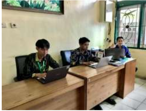
Figure 6. Process of creating the Plenary Meeting invitation letter