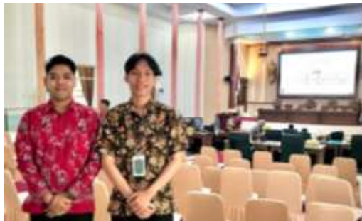
Figure 7. Photo After the Plenary Meeting