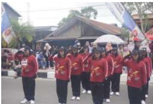
Figure 11. Photo during the participation in the Marching Competition