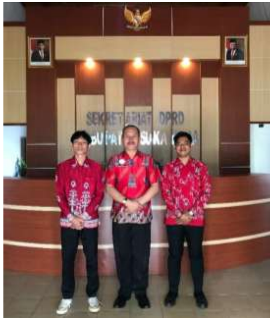
Figure 2. After the acceptance of the application letter by the Council Secretary

At this stage, the author was introduced to the organizational structure of the DPRD and the functions and duties of each division, including the Proceedings and Legislation Division. After the orientation, the author then conducted a further introduction to the Proceedings and Legislation Division. This included understanding the process of organizing DPRD meetings, from planning the agenda to implementing and documenting the results of the meetings. The author was also invited to observe several meetings firsthand, so they could see the dynamics of interaction between council members and secretariat staff.