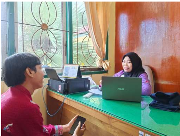
Figure 4. Introduction to the Budget and Supervision Division staff

At the beginning of this activity, emphasis was also placed on the importance of communication and collaboration between various sections within the DPRD Secretariat. Interns were invited to participate in internal discussions involving council members and staff, so that they could experience the working atmosphere and understand the challenges faced in carrying out legislative tasks.